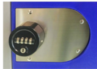
Round Combination Lock