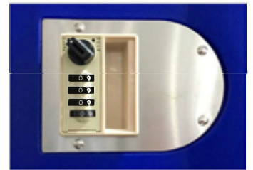
4-Digit Combination Lock