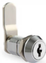
Cylinder Cam Lock