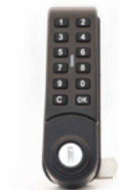
Digital Electronic Lock