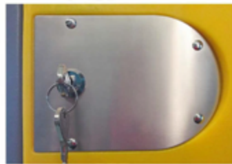
Disc Cam Lock