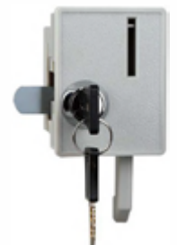
Coin Operated Lock