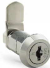
Cylinder Replaceable Cam Lock