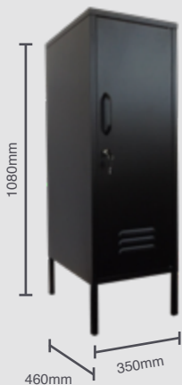
1080H MINI LOCKER