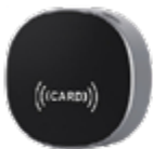
M 1602 IC